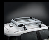
Luggage rack, lockable