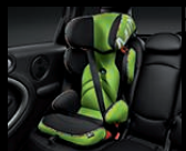
MINI junior seat group 2/3