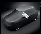
Indoor/outdoor car cover