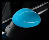
Exterior mirror caps in Shocking Blue 2