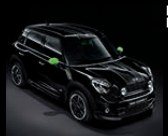
MINI RAY package, Alien Green 1