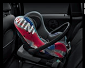
MINI baby seat group 0+