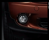
LED daytime running light