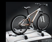
Touring cycle holder, lockable