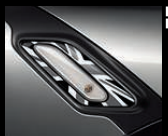
Side scuttles with Black Jack design