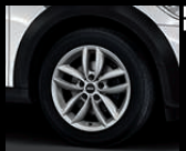
Double Spoke R124 in Silver, size 7J x 17 inches, winter tyre