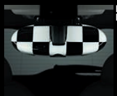
Rear-view mirror housing with Checkered Flag design