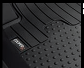
All-weather floor mats