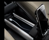
Universal holder for mobile devices