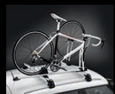
Racing cycle holder, lockable