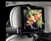
Travel and Comfort System bracket for Apple iPad (2-4) / iPad mini