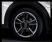
5-Star Double Spoke Composite R127 in Black, size 7.5J x 18 inches