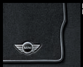
Textile floor mats