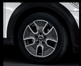
Tunnel Spoke R125 in Anthracite, size 7J x 17 inches