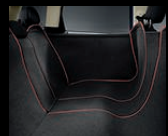
Protective rear cover