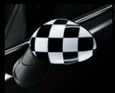
Exterior mirror caps with Checkered Flag design