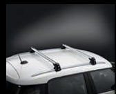
Roof rack base support system for roof rails, lockable