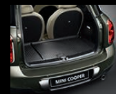
Luggage compartment mat, fitted