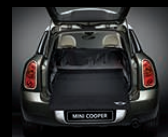
Protective bootspace cover