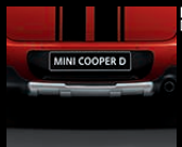
Optical under-ride kit